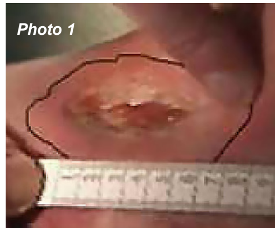
3 months after start of Veinoplus®

In June 2006, the examining phlebologist observed reactivation and reopening of the ulcer. After one month, while reestablishing daily stimulations (20 minutes) with VEINOPLUS®, the ulcer healed completely again. In conclusion, the results of healing venous ulcers are encouraging and are warranting to enter into controlled clinical studies on this subject.